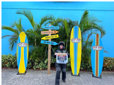
Ron Jon's at Cocoa Beach

hopped back on the bike headed for Key West.