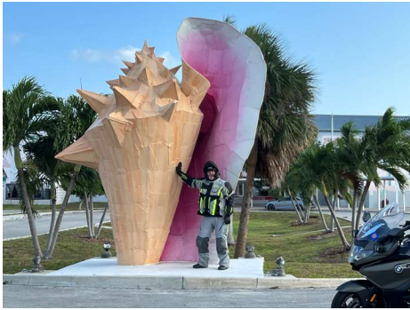
Giant Conch Shell

around the parking lot to get their picture!