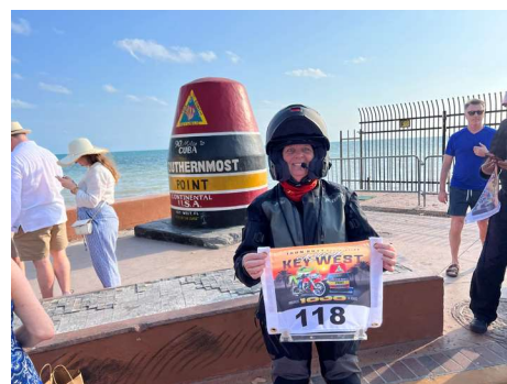
Most Southern Point