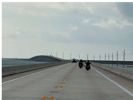
Overseas Highway thru the Keys

By now, the temperature was up to 86 degrees! It was awesome! We couldn't wait to get into some beautiful sunny weather to ride! This winter had lasted way too long!