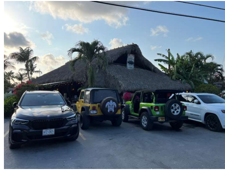
Hogfish Bar and Grill

dessert! All in all, a wonderful meal for hungry travelers!