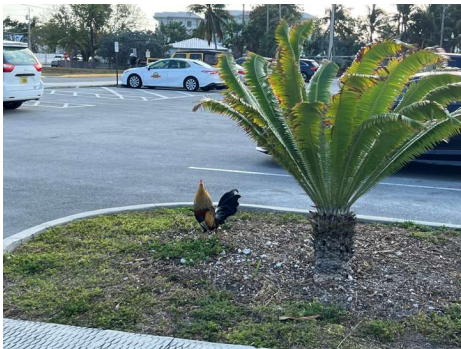
Famous Key West Chickens

By now, it's after 5:00 pm, we were hungry! We hadn't eaten anything all day. So, we stopped in the next Key, Stock Island, at the Hogfish Bar and Grill. We wanted to try their famous sandwich!